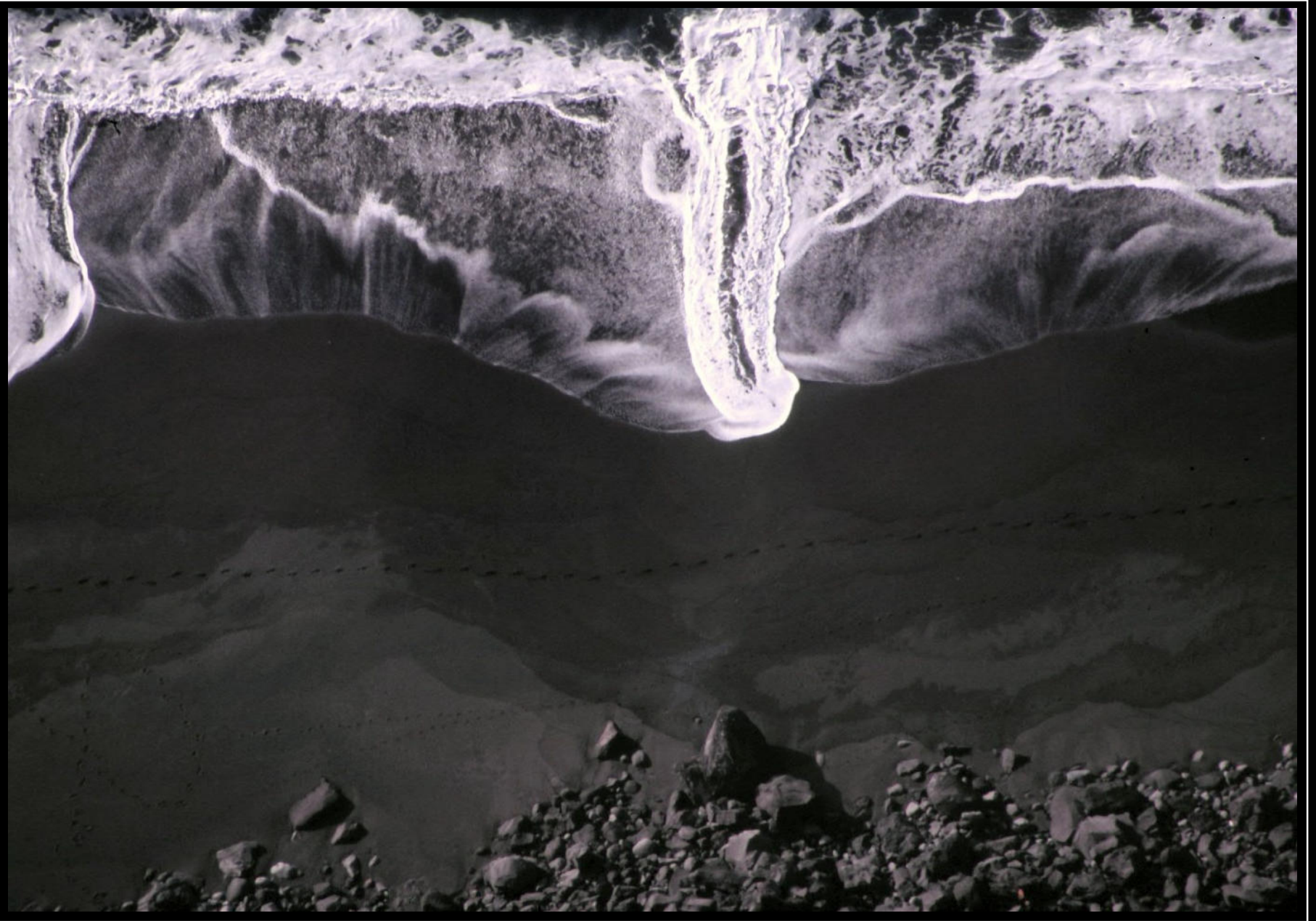
☺ You can't escape the waves of life, but you can learn how to surf on them. ☺ Water and sand are balancing at the Playa de Benijo in the north-eastern part of Tenerife – September 2006